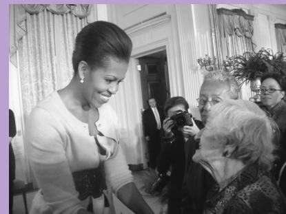
OWL champion Ruth Nadel speaks with Michelle Obama at the White House

By age 45, women have earned $122,000 less than their male counterparts, and by age 65, the number more than doubles to $379,000.